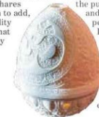
►Mystic cone: A rare mythological artifact

home is replete with both." Books of all genres and age groups are spread across expansive wooden book-shelves in the living room, study and children's bedroom. A fascinating aspect of this home is the puja room that has idols and symbols of almost every perceivable faith. Idols of Lord Shiva and Buddha blend to create the subtle spiritual essence of the study. A single wall painted in a deep green plays up the overall look of the study while the living room is painted in an energetic yellow.