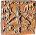
▲Faunal trance: A recreation of the Pashupati seal that was discovered in an Indus Valley civilisation site